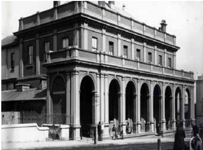
Image: Supreme Court, King Street, Sydney (NSW). Digital ID: 4481_a026_000411