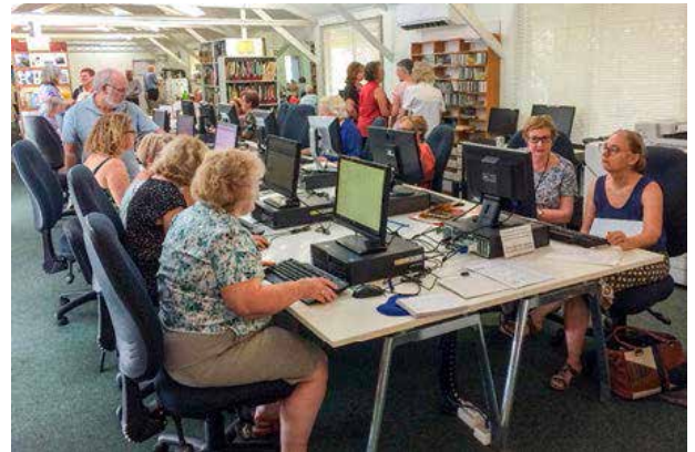
GSQ Volunteers helping Open Day visitors with their family history research