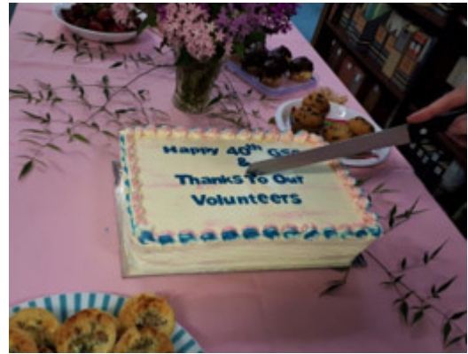
40th birthday cake