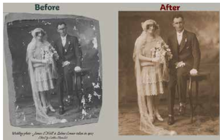
Photo editing and retouching - BOOKED OUT

Join this webinar to find out more about the pensioner records and how you might locate your ancestor.