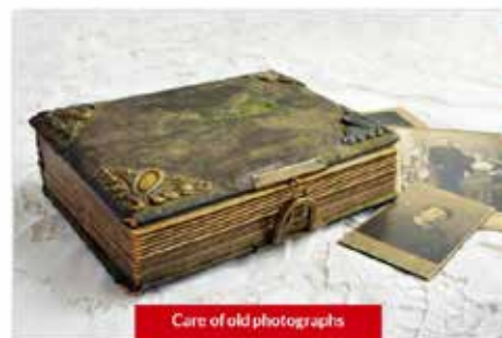
Identification, restoration and storage

By placing where they lived onto a map, you can identify migration patterns, perhaps view the land they owned in the context of others in the area and gain a better understanding of your ancestor in place and time. For example, have you ever wondered how close your ancestors lived to one another? Where exactly was your great-grandmother born? Seeing significant events from your family’s past on a map allows you to gain a clearer picture of your family’s journey.