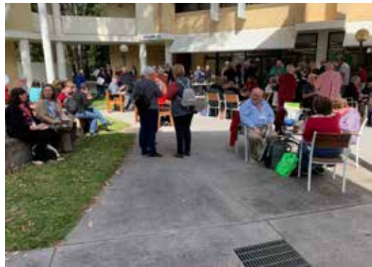
Lunch time see who you can spot.