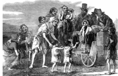
Distributing clothing to the destitute, Kilrush, Ireland