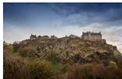
Edinburgh Castle

How to make the most of this wonderful site. Hands On session – limit of 14 participants. .....