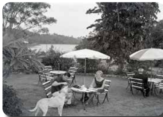
Lone Pine Sanctuary, 1966