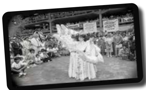
China Town Mall, 1987