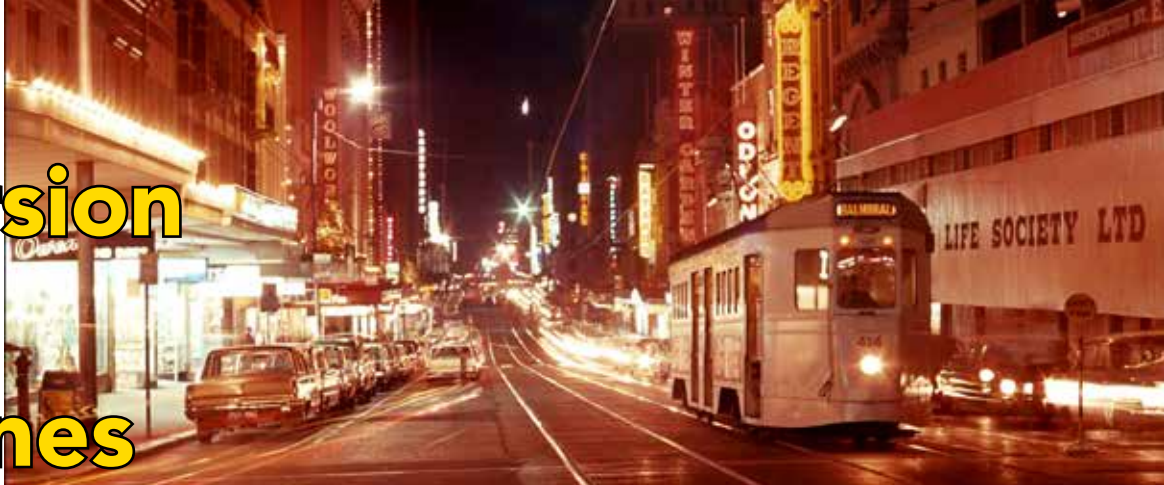
Balmoral Tram on Queen St, 1968, Images from Brisbane Archives.