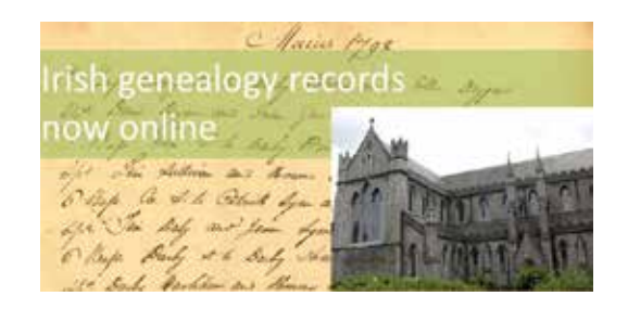
Irish Online: Leaping ahead in 2021 May 1 @ 9:00 AM - 11:00 AM Virtually via ZOOM Presenter: Bobbie Edes

This presentation will highlight a range of resources for exploring our ancestors' occupations and how you can discover the kind of work your ancestors may have undertaken. BOOK HERE