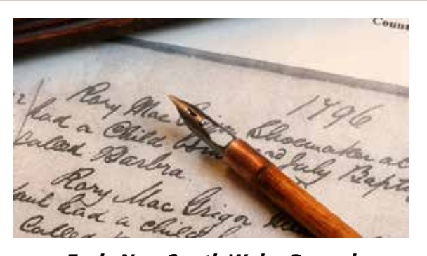
Early New South Wales Records April 10 @ 9:00 AM - 11:00 AM Hands-on at GSQ

Are you unsure about how to compile trees on Family History programs? This could be the presentation to ensure you go about it in the correct manner! BOOK HERE